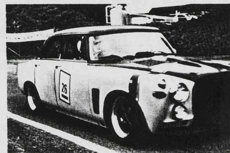
Simon Legge muscling the PC5 around