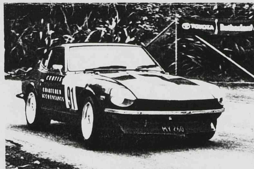
Don McLean at Speed